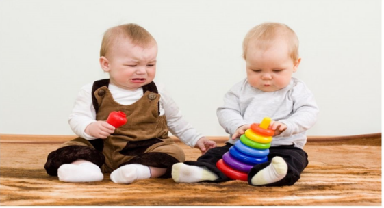
Selfish or Selfless: Which are You?